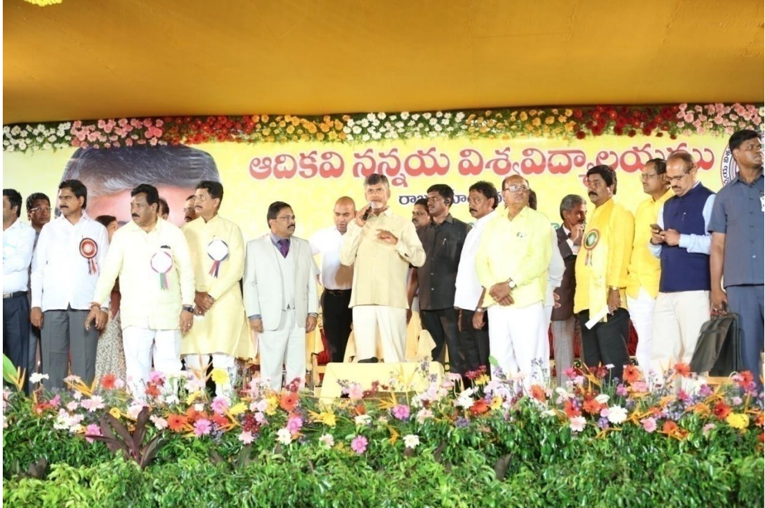
A GALAXY OF VIPS- MINISTERS, MPS, MLAS BEAUROCRATS, ACADEMIA and INTELLIGENTSIA on the fully decked up dias