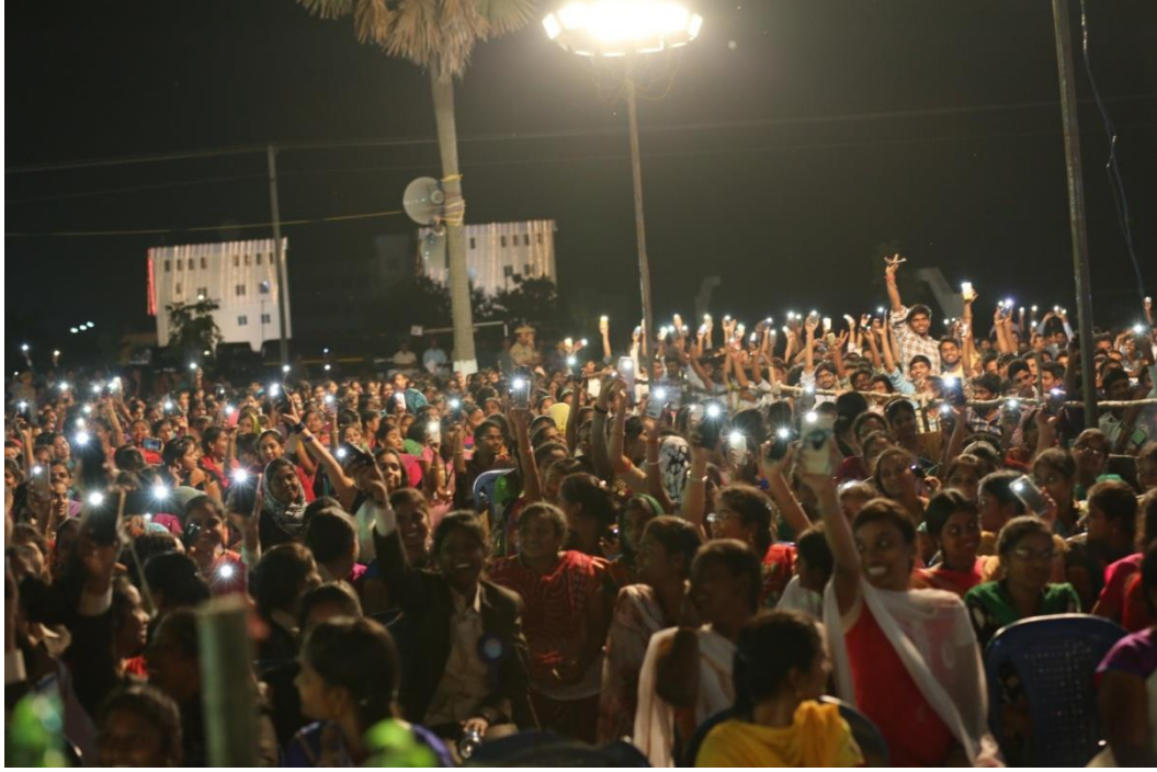
THE STUDENTS' RESPONSE TO THE CM'S CALL FOR YOUNG DIGITAL INDIA