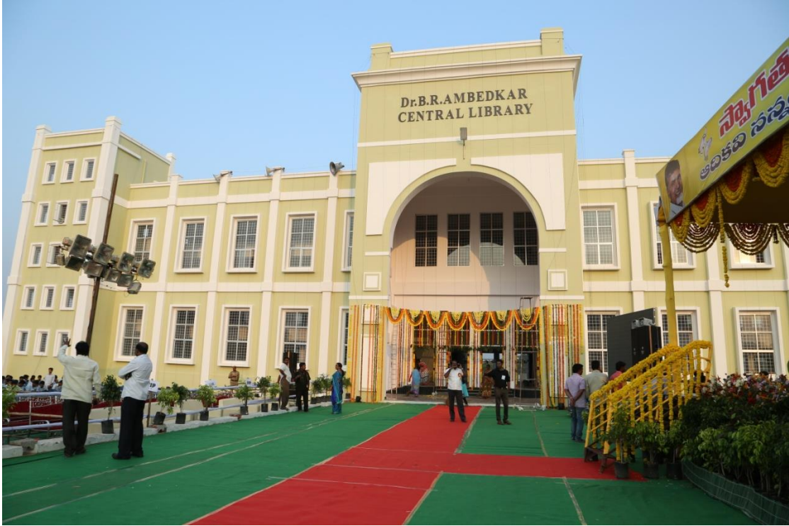
Dr. B.R. Ambedkar Central Library, College of Engineering and Women's Hostel being Inaugurated by the Hon'ble Chief Minister of Andhra Pradesh