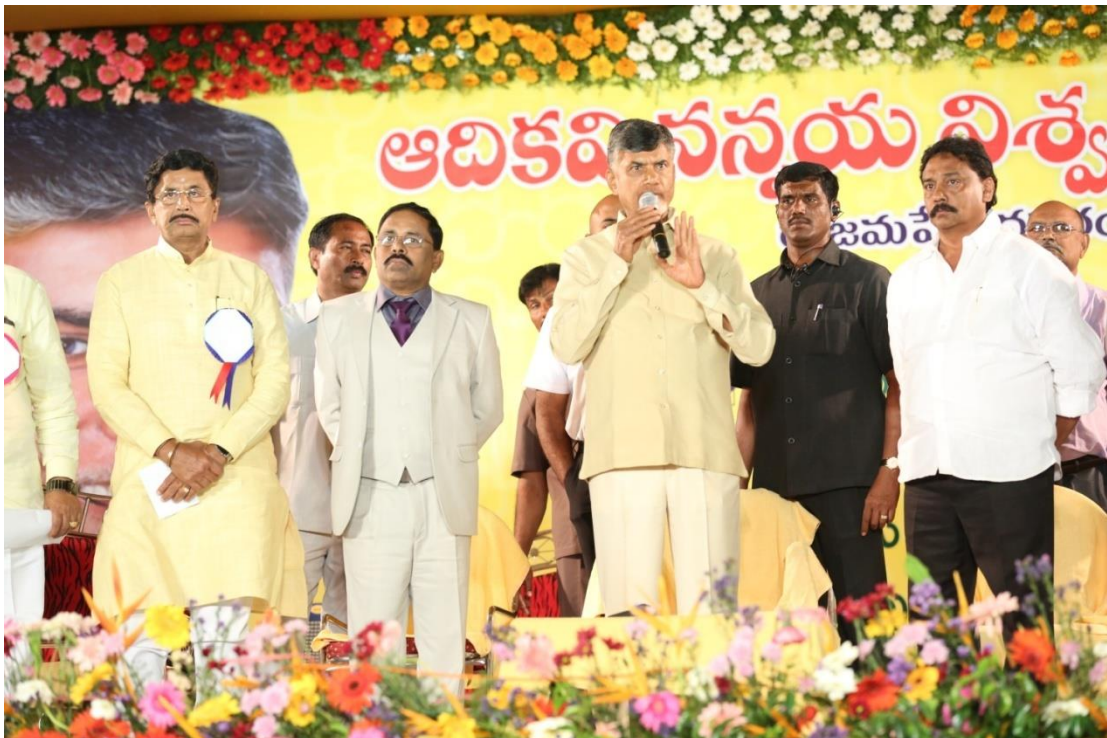
CM NARA CHANDRA BABU NAIDU ADDRESSING THE STUDENTS OF ANUR