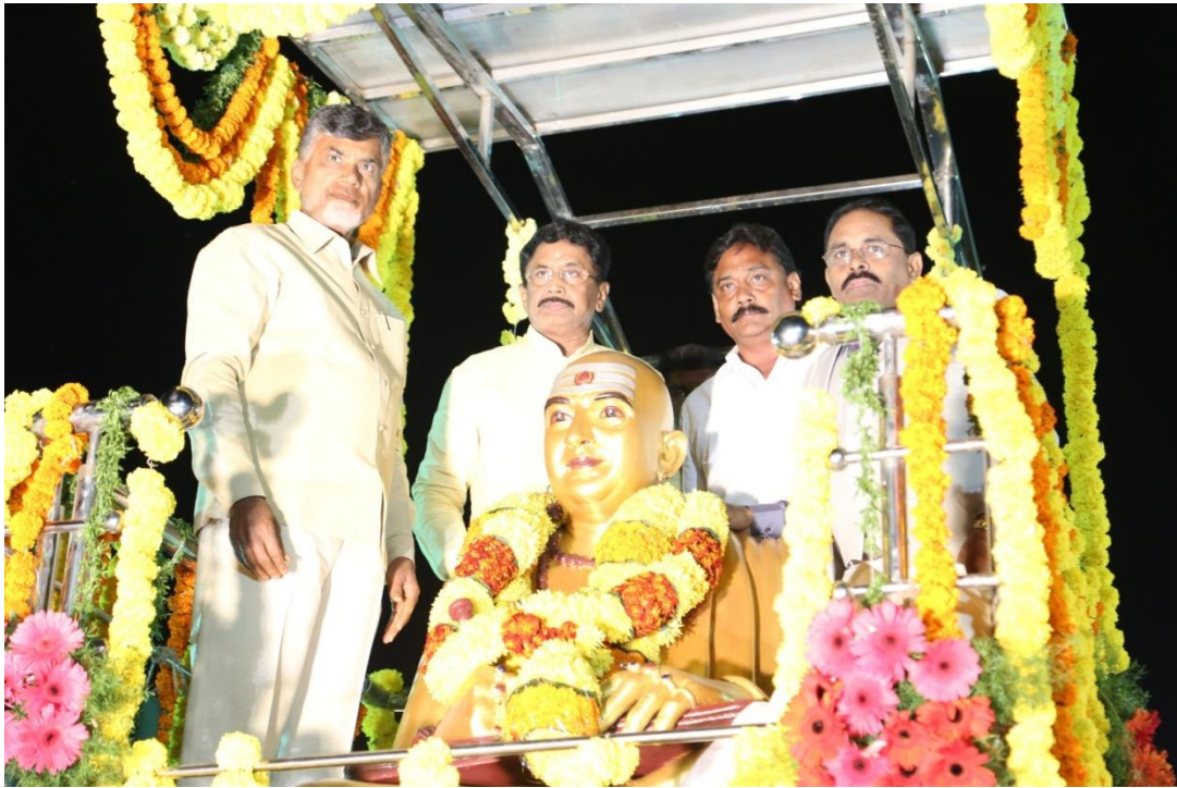
UNVEILING THE ADIKAVI NANNAYA STATUE BY SHRI NARA CHANDRA BABU NAIDU