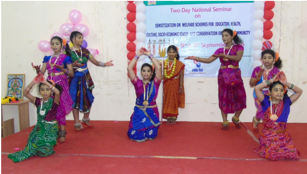
Worshipping the Tribal Goddess by the local community